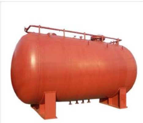
MS STORAGE TANKS

We have technologically developed Industrial Storage Tank that is used as a container to hold liquids, compressed gases. These are cylindrical in shape, upright to the ground with flat bottoms and come with flat floating roof. Our storage tanks are developed on the basis international standards and parameters that make them demanded on world market too. These storage tanks are highly preferred for their unique features including corrosion resistance, weather proof surface, anti-leakage and sturdy structure. We make them available in various capacities in both mild and stainless steel.