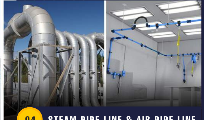
04 STEAM PIPE LINE & AIR PIPE LINE