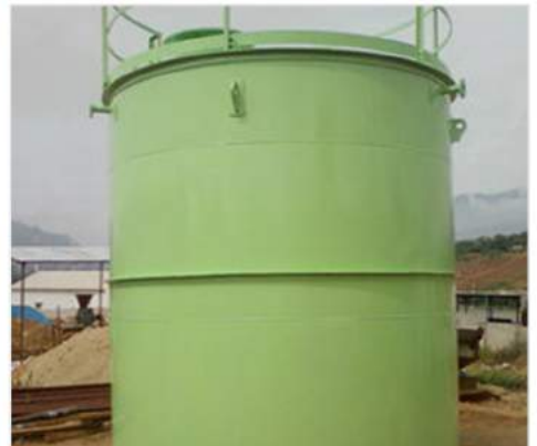
VERTICAL MS TANKS