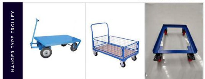
HANGER TYPE TROLLEY