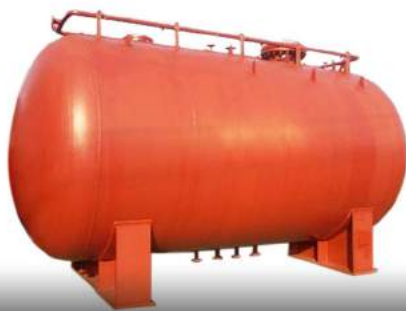
05 INDUSTRIAL MS TANKS WORKS