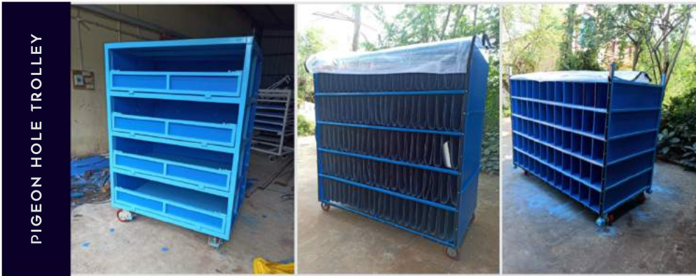
PIGEON HOLE TROLLEY