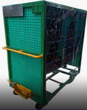
01 INDUSTRIAL TROLLEYS