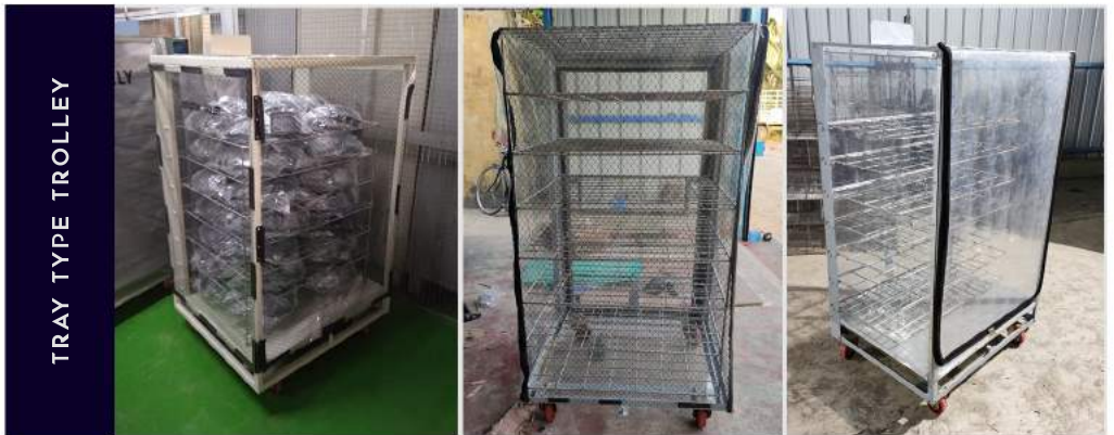
TRAY TYPE TROLLEY