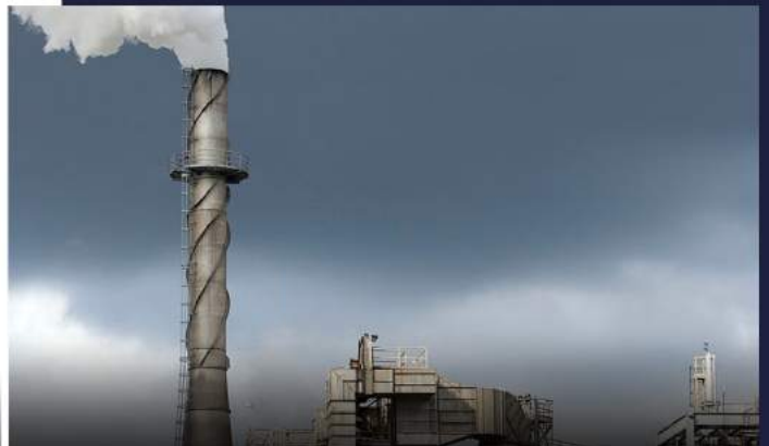
06 ALL TYPE OF CHIMNEY WORKS