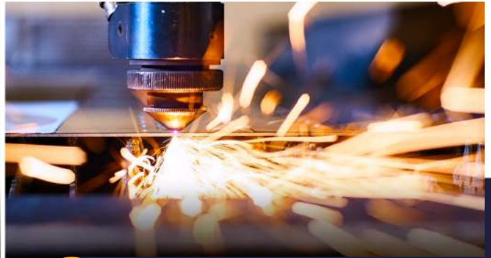
02 INDUSTRIAL FABRICATIONS