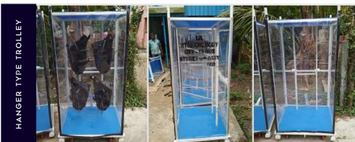
HANGER TYPE TROLLEY