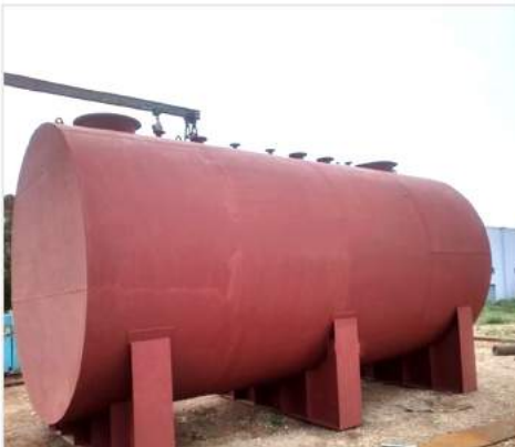
MS CHEMICAL STORAGE TANKS