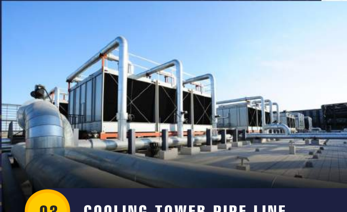
03 COOLING TOWER PIPE LINE